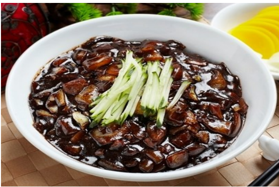
Jajang myun 자장면 $15.95 Korean black bean noodle w/pork.