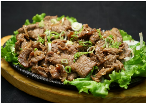
Bulgogi $29.95 sautéed thinly sliced beef marinated w/ Korean b.b.q. sauce.