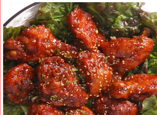
Seoul chicken $23.95 양념 치킨 you can choice deep fried chicken wings or boneless chicken thighs w/ Toro's special sweet & hot sauce.