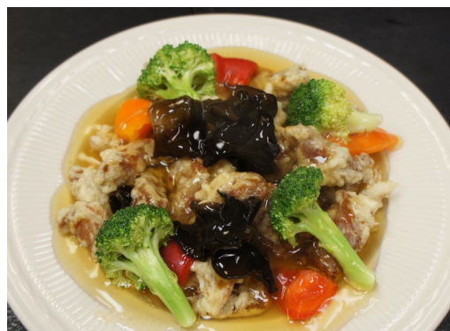
Tang-soo-yook 탕수육 $23.95 deep fried marinated pork w/ sweet & sour sauce.