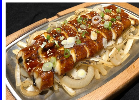
grilled eel 장어구이 $26.95