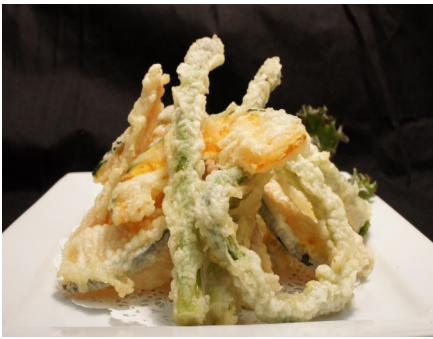
mixed vegetables tempura $15.95

deep fried w/ Japanese crispy batter. served w/ rice & miso soup.