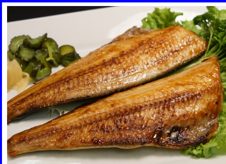
grilled atka mackerel 이면수 구이 $24.95