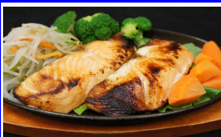
grilled salmon 연어구이 $28.95