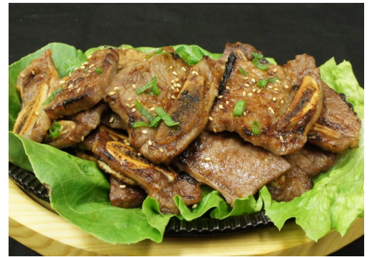
L.A Kalbi (with bone) $33.95 grilled marinated sliced beef short rib.