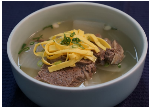
Kalbi tang 갈비탕 $22.95 beef short rib w/ potato noodle soup.