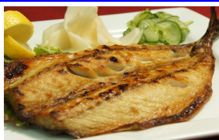
grilled mackerel 고등어 구이 $22.95