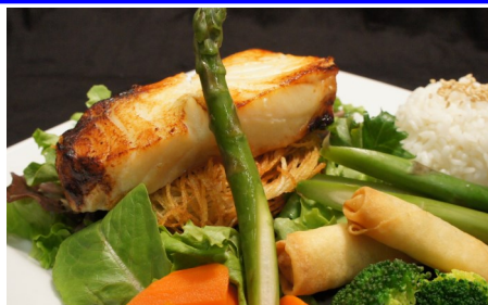
grilled Chilean sea bass 칠레산 농어구이 $32.95 marinated w/ miso sauce