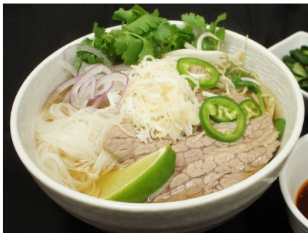
Pho $14.95 월남쌀국수 choice of beef chicken