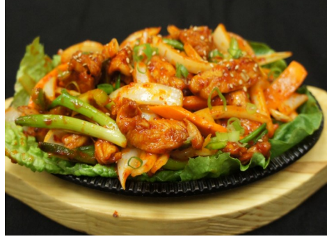
spicy chicken $22.95 사육 볶음 sautéed chicken & vegetables.