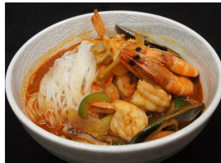
spicy Pho 매운쌀국수 seafood $16.95 (scallop, shrimp, clam, squid, mussel). chicken $14.95