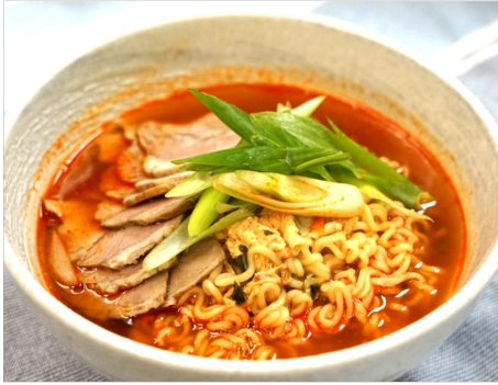
Ra myun 라면 $14.95 choice of plain, pork, chicken, beef.