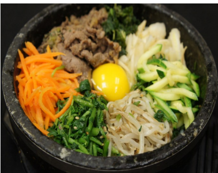
Gopdol bibimbab 곱돌 비빔밥 sizzling hot stone rice bowl served w/ miso soup, Kimchi & Go-Choo-Jang sauce. you can choice of beef, pork, chicken, tofu, vegetables.....$17.95 spicy pork & Kimchi gopdol .....$18.95