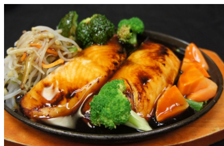
chicken teriyaki $19.95