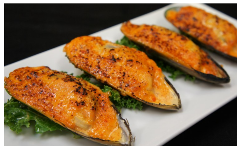
spicy mussel $10.95 매운 홍합 구이 grilled New Zealand green shell mussel w/ Toro's special spicy sauce .