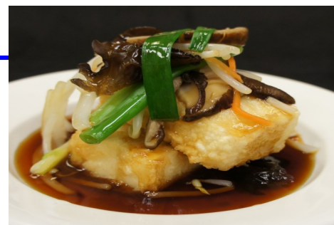
agedashi tofu $7.95 두부 튀김 deep fried soft tofu w/ soy glaze.