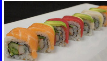
rainbow 12.95 avocado, crabmeat, cucumber, salmon, tuna, white fish.