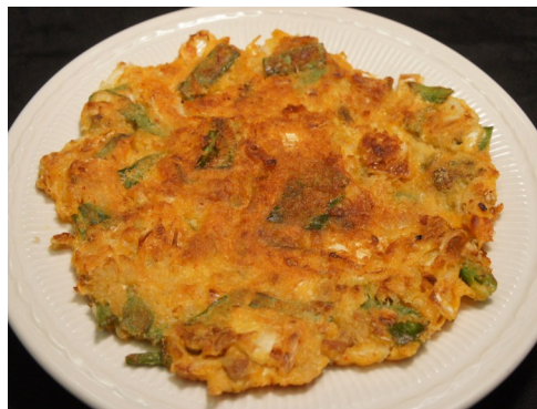
Kimchi pajun $16.95 김치파전 Kimchi w/ scallion pancake.