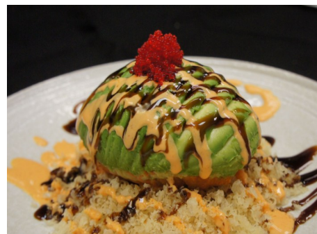
super ball $13.95 avocado stuffed w/ crabmeat, spicy tuna , crunch w/ spicy sauce & brown sushi sauce tobiko on top.