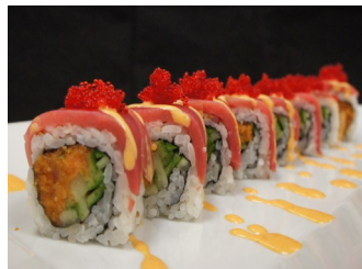
bunny 13.95 spicy tuna , cucumber, tuna w/ spicy sauce , tobiko on top.