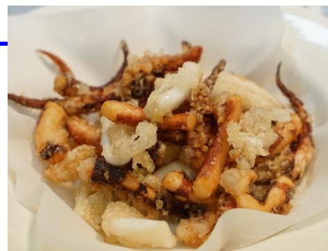
fried squid $11.95 오징어 튀김 geso age