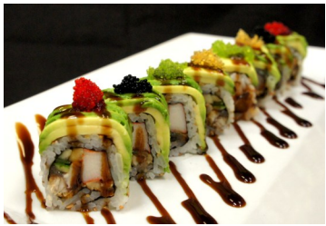
dragon 13.95 avocado, crabmeat, cucumber, eel w/ brown sushi sauce.