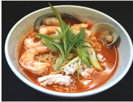
seafood Ra myun 해물 라면 $19.95