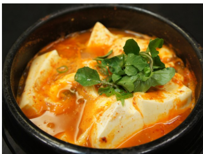
Soon-doo-boo $19.95 순두부 찌개 soft tofu soup.