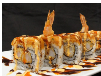
U.F.O 12.95 shrimp tempura, spicy tuna w/ brown sushi sauce & spicy sauce .