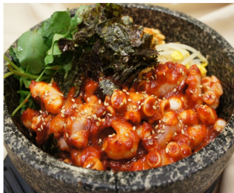
nak ji gopdol

flying fish roe, & various seasoned vegetables in hot stone bowl.