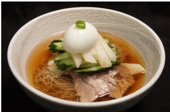
non spicy 물냉면 $17.95