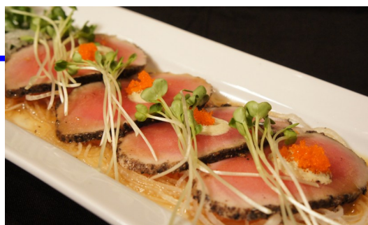
tuna tataki $14.95 seared tuna in vinaigrette soy sauce.