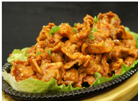
Jae-yook-gui $26.95 제육 구이 sautéed thinly sliced pork shoulder w/ Korean spicy sauce .