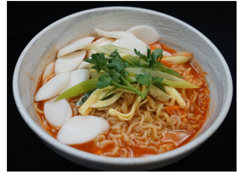
Tuk Ra myun $18.95 떡 라면 choice of pork, chicken, beef, w/ sliced Korean rice cake.