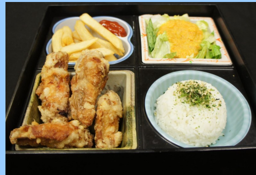
superman chicken wings $ 14.95