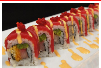
French kiss 13.95 yellowtail, crunch, asparagus, tuna, w/ spicy sauce , tobiko on top.