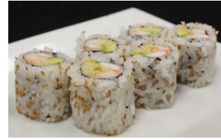
Jeff 7.95 shrimp, crabmeat, avocado, crunch.