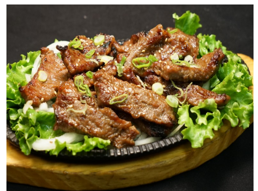
Kalbi (without bone) $39.95 grilled marinated beef short rib.