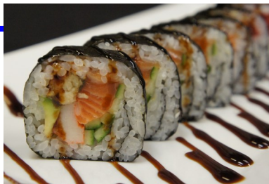
big mac 14.95 eel, salmon, crabmeat, avocado, cucumber w/ brown sushi sauce.