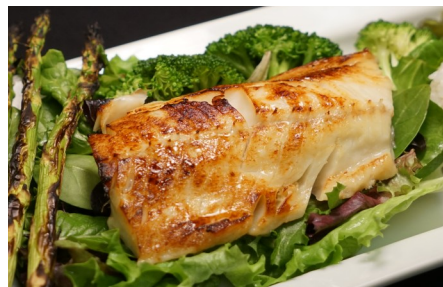
grilled black cod fish 은대구구이 $32.95 Marinated w/ miso sauce.