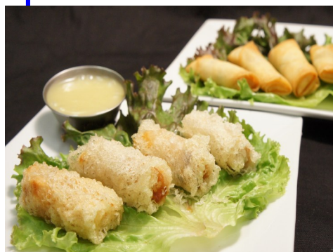
harumaki $7.95 deep fried spring roll. (choice of vegetables or shrimp)