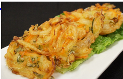
vegetable tempura $7.95