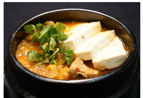
Kimchi-chigae $20.95 김치찌개 Kimchi w/ pork, tofu, mushrooms and potato noodle soup.

choice of pork, beef, seafood, spicy tuna and vegetables.