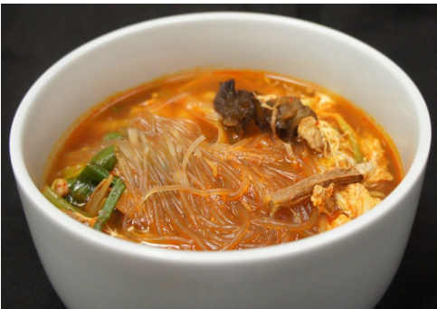
Yook-gae-jang 육개장 $20.95 thinly sliced beef & vegetables w/ potato noodle spicy soup.

served w/ rice, Kimchi . for spicy soup, we can make them mild or non-spicy. ask to your server.