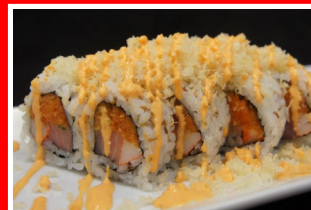
rock'n roll 9.95 spicy tuna , yellowtail, crabmeat, crunch w/ spicy sauce .