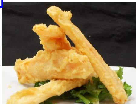
sweet potato tempura $6.95 고구마 튀김