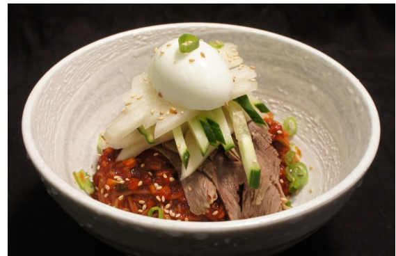
spicy 비빔냉면 $17.95