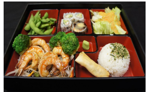
shrimp teriyaki $18.95