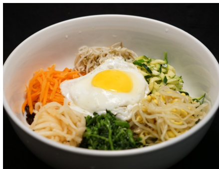
Bi-bim-bab 비빔밥 $16.95 Korean famous vegetables ( Na-mool ) mixed rice bowl w/ Go-choo-jang sauce.