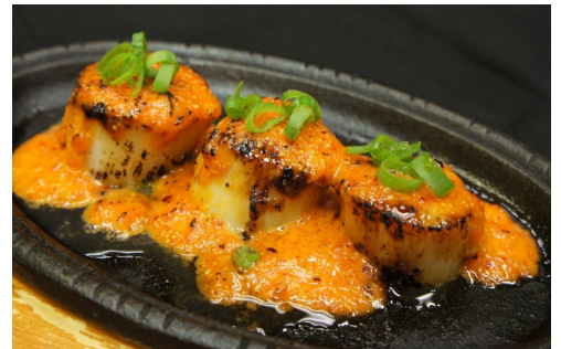
spicy scallop $16.95 가리비 조개 판자 구이 grilled scallop w/ Toro's special spicy sauce .