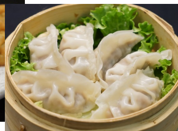
mandoo beef mandoo $8.95 shrimp mandoo $10.95 vegetables mandoo $7.95 Kimch mandoo $10.95 Kimch w/pork.