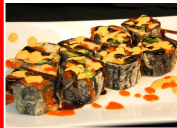
gozilla 13.95 (deep fried roll) spicy tuna , crabmeat, broccoli, asparagus w/ spicy sauce & brown sushi sauce.