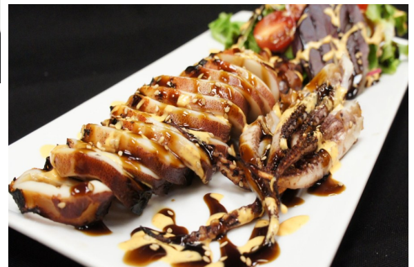
grilled squid $21.95 통 오징어 구이 w/ spicy or non spicy sauce.