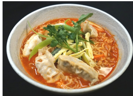
Mandoo Ra myun 만두 라면 $18.95 choice of pork, chicken, beef, w/ Korean dumpling.