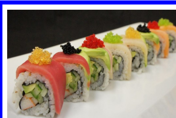
kimono 13.95 crabmeat, avocado, cucumber, tuna, salmon, yellowtail, tobiko on top.