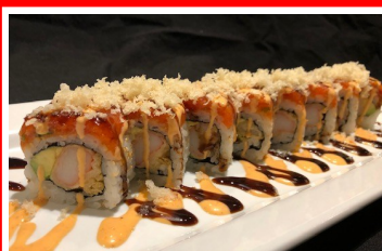
crab on fire 13.95 crabmeat tempura, avocado, spicy tuna w/ spicy sauce & brown sushi sauce & crunch.