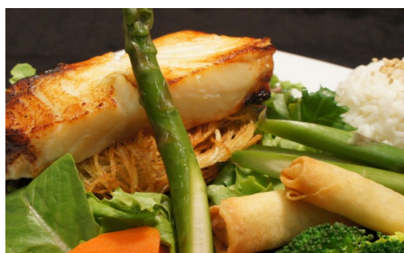
grilled Chilean sea bass 칠레산 농어구이 $33.95 marinated w/ miso sauce