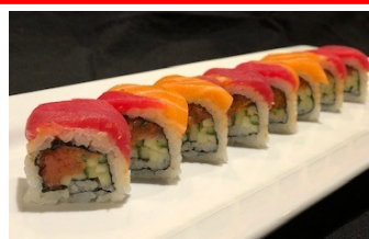
trio 12.95 cucumber, spicy tuna tuna, salmon.