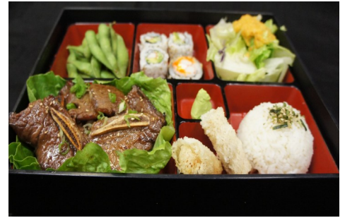
L.A. Kalbi $21.95