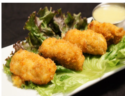
fried oyster $10.95