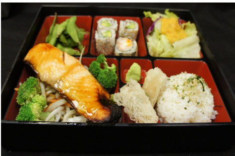
salmon teriyaki $18.95