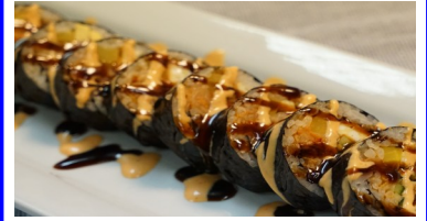
Fishkill 14.95 shrimp tempura, spicy crabmeat, avocado, cucumber.