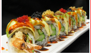
magic 13.95 shrimp tempura, asparagus, avocado w/ spicy sauce & brown sushi sauce.