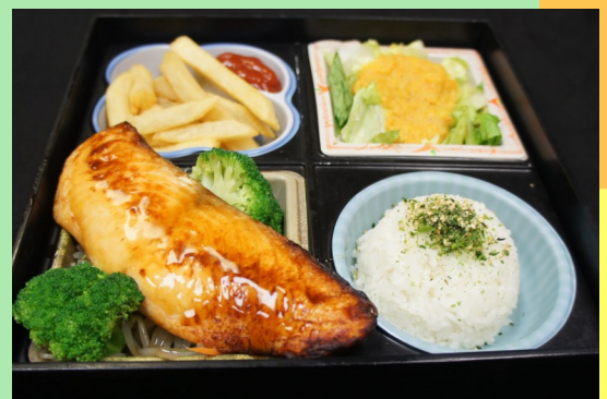
marine boy salmon teriyaki $ 16.95