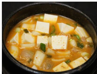
Dwen-jang $19.95 된장 찌개 bean paste & tofu soup.

choice of pork, beef, seafood, spicy tuna and vegetables.