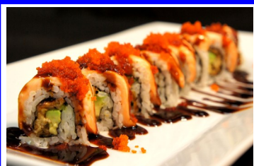
fire house (grilled roll) 13.95 eel, avocado, grilled salmon w/ brown sushi sauce.