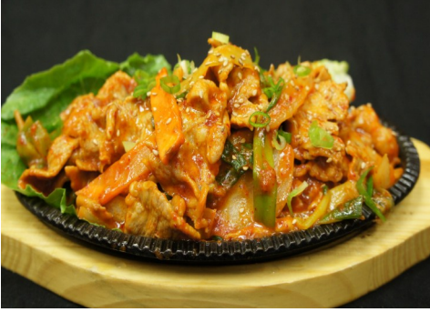
spicy pork $26.95 제육 볶음 sautéed thinly sliced pork & vegetables.