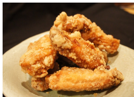
fried chicken wing $10.95 닭날개 튀김