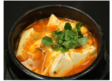
Soon-doo-boo 순두부찌게 $17.95 soft tofu soup.