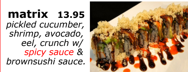
matrix 13.95 pickled cucumber, shrimp, avocado, eel, crunch w/ spicy sauce & brown sushi sauce.