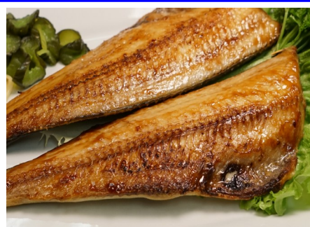
grilled atka mackerel 이면수 구이 $26.95