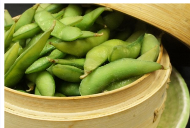
edamame $6.95 steamed green soy beans.