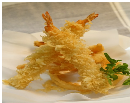
tempura $9.95 deep fried shrimp or chicken w/ vegetables.