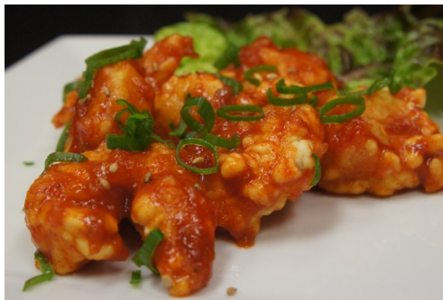
spicy pop shrimp 매운 새우튀김 $12.95 fried shrimp w/sweet & spicy sauce .