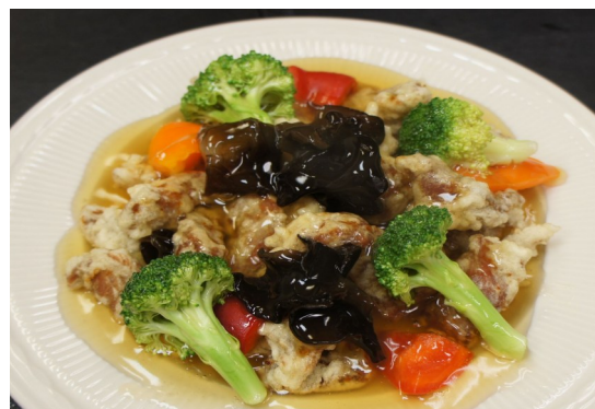
Tang-soo-yook 탕수육 $25.95 deep fried marinated pork w/ sweet & sour sauce.