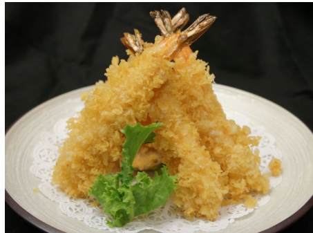
shrimp tempura $20.95 chicken tempura $19.95