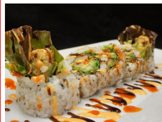
tornado 12.95 tuna tempura, lettuce, avocado, cucumber w/ spicy sauce & brown sushi sauce.