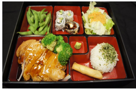
chicken teriyaki $16.95