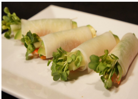
summer angel $9.95 choice of shrimp or spicy tuna w/ avocado, crabmeat, cucumber, radish sprout, wrapped w/ radish paper.