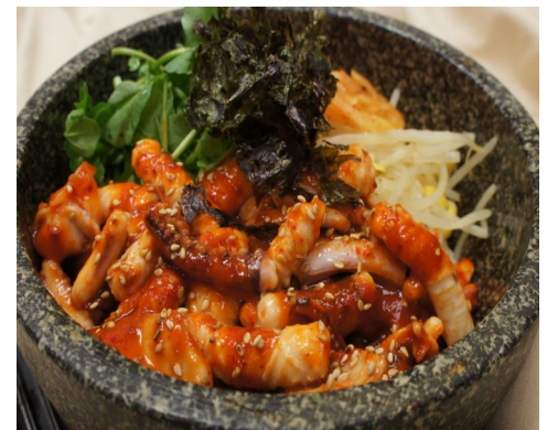
o jing uh gopdol