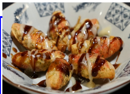
fried crab stick $7.95