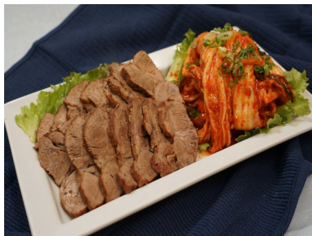
Fresh Kimch Bo-ssam 것절이 보쌈 $27.95 steamed pork shoulder w/fresh Kimch