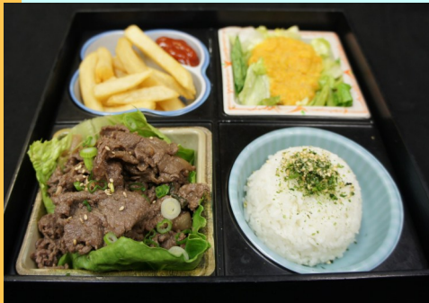
ironman bulgogi $14.95

served w/ green salad, French fries, rice, miso soup.