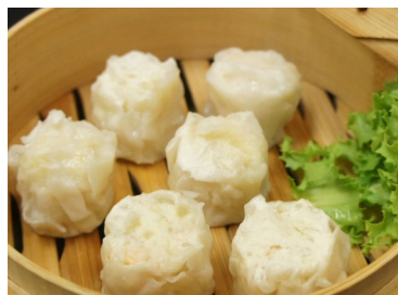
shumai $7.95 steamed or fried shrimp dumpling.