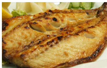
grilled mackerel 고등어 구이 $24.95