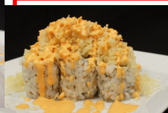
volcano 7.95 spicy tuna , cucumber, crunch w/ spicy sauce .