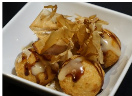
tako ball $8.95