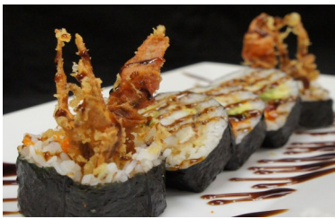
spider 15.95 soft shell crab tempura, avocado, cucumber w/ brown sushi sauce.