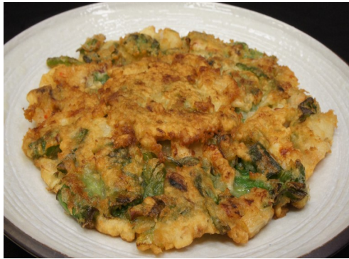
Haemul pajun $16.95 해물파전 seafood w/scallion pancake.