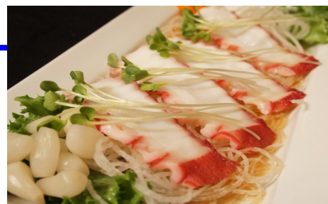
takosu $14.95 sliced octopus served in vinaigrette soy sauce.