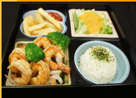
x-man shrimp teriyaki $16.95