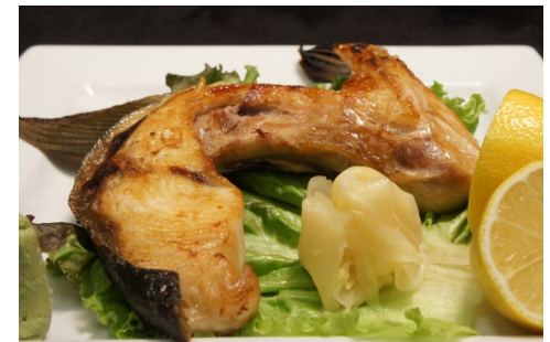
grilled yellow tail gill Hamach gama $15.95