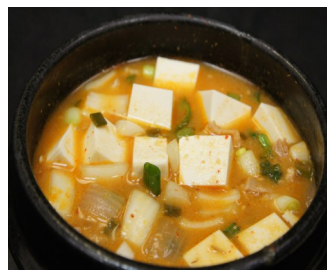
Dwen-jang 된장찌게 $17.95 bean paste & tofu soup.