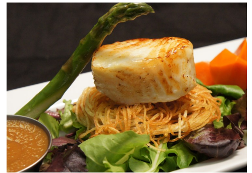
grilled Chilean sea bass $15.95 marinated w/ miso sauce.