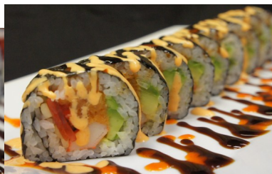
bull dog 14.95 spicy tuna , cucumber, avocado, crabmeat Japanese pickle, w/ spicy sauce & brown sushi sauce.