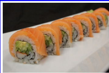
moon river 12.95 crabmeat, avocado, cucumber, smoked salmon.