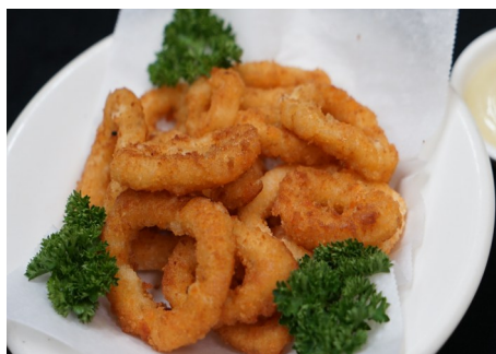
fried calamari $12.95 오징어링 튀김