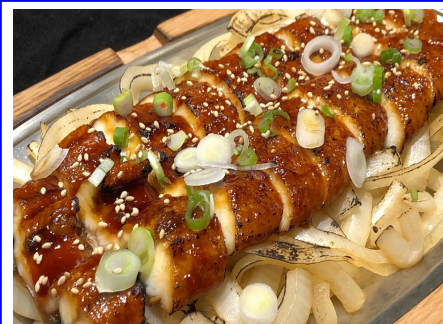
grilled eel 장어구이 $26.95