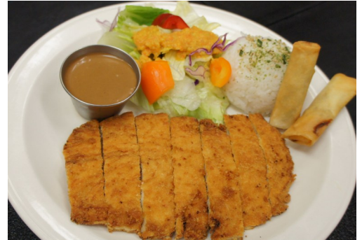
chicken katsu $19.95 pork katsu $19.95

cutlet battered bread crumbs. served w/ miso soup, salad & rice.