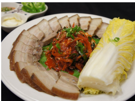
Bo-ssam $27.95 돼지 수육 보쌈 steamed pork belly w/ spiced radish & light salted Korean cabbage.