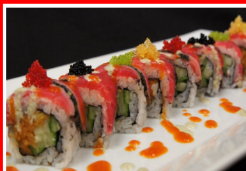
M-16 13.95 spicy tuna , cucumber, seared tuna w/ spicy sauce & caper sauce, tobiko on top.