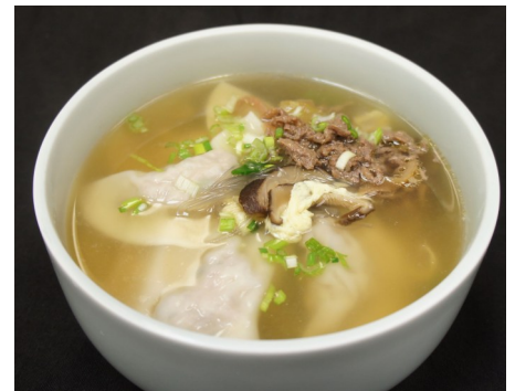
Man-doo-gook 만두 국 $20.95 meat or vege, dumpling w/ potato noodle soup.