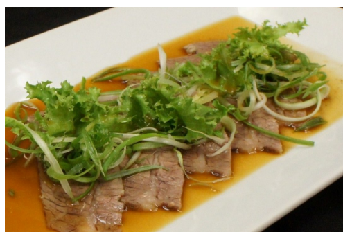
soo yook $15.95 sliced beef brisket, scallion served in vinaigrette soy sauce.