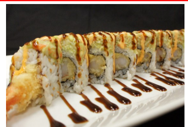
morning 12.95 (deep fried roll) cream cheese, crabmeat, w/ horny wasabi sauce & brown sushi sauce.