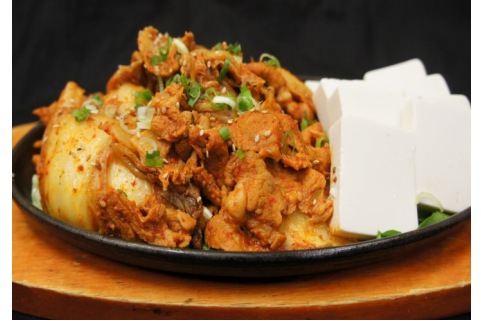
spicy pork & Kimchi 제육 김치볶음 $27.95 sautéed thinly sliced pork & Kimchi w/ steamed tofu.