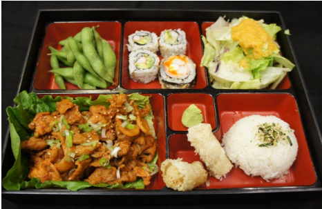
spicy pork $16.95