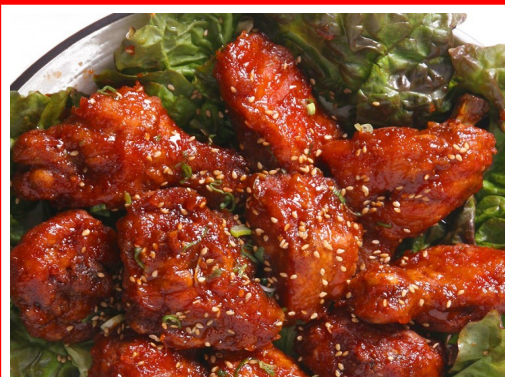
Seoul chicken $24.95 양념 치킨 you can choice deep fried chicken wings or boneless chicken thighs w/ Toro's special sweet & hot sauce.