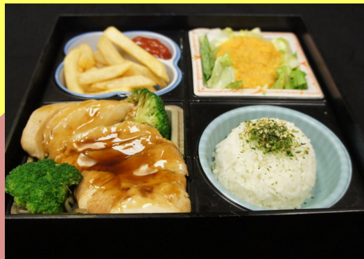
spiderman chicken teriyaki $14.95