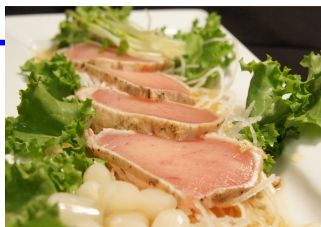
albacore tataki $12.95 baked w/ minced garlic in vinaigrette soy sauce.