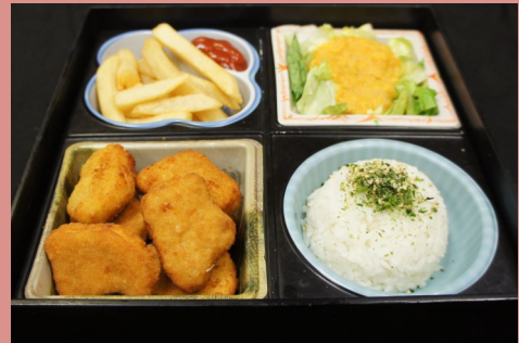
batman chicken nugget $ 13.95