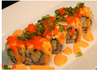
fire scallop 12.95 seared scallop, avocado, crabmeat w/ spicy sauce , scallion on top.