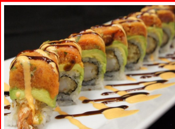
Ginza 13.95 shrimp tempura, avocado, spicy tuna w/ spicy sauce & brown sushi sauce.